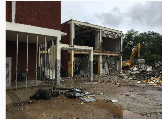
Reshoring of failing existing column