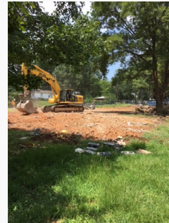
Demolition of the Trailers