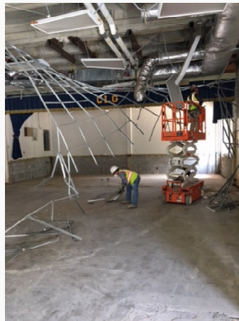
Interior demolition of the auditorium